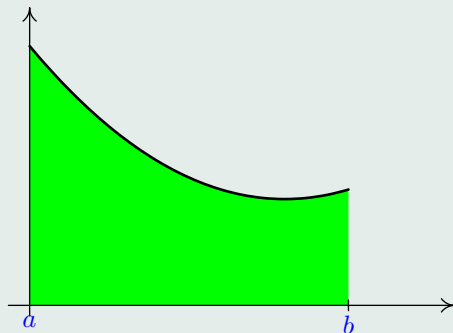
Figure 1: Floating figure