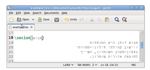
Figure 1: Using traditional sectioning directive with right-to-left text

Figure 1 depicting the use of gedit to compose a Hebrew IAT_EX document may help in visualizing the difficulty. Line 18 containing the section title is laid out left-to-right, despite the fact that the title is written Hebrew, in visual discrepancy with lines 19 and on, containing the section body, which are laid out right-to-left.