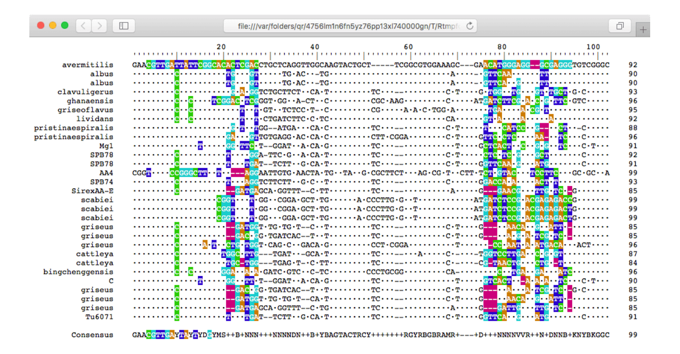
Figure 2: Amplicon with the target site for each primer colored